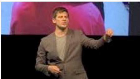
The Future of Food: Josh Tetrick TEDx Talks 73K views

https://www.youtube.com/watch?v=QVTkdpfeb8A